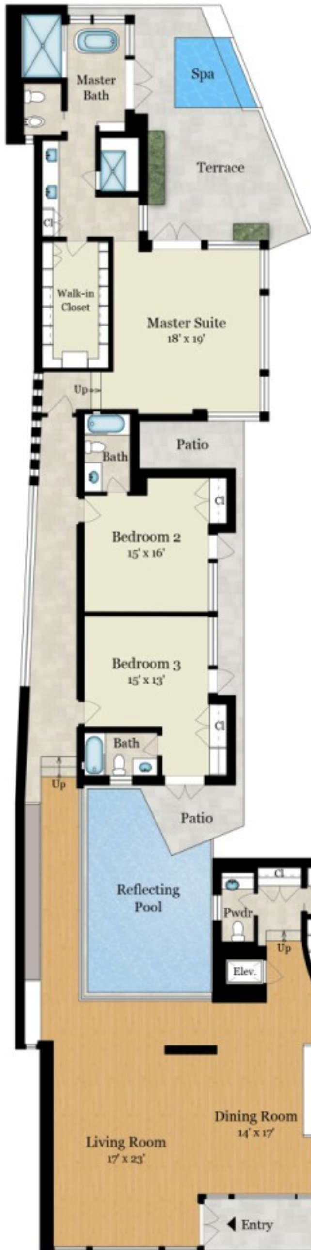
MAIN LEVEL 4,265 SQ FT